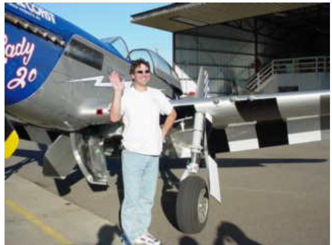
"Hey, you losers!"