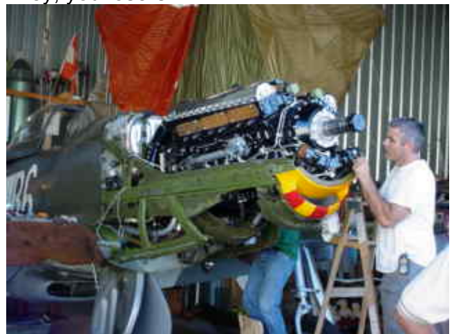
Installing the re-built Rolls Royce Merlin