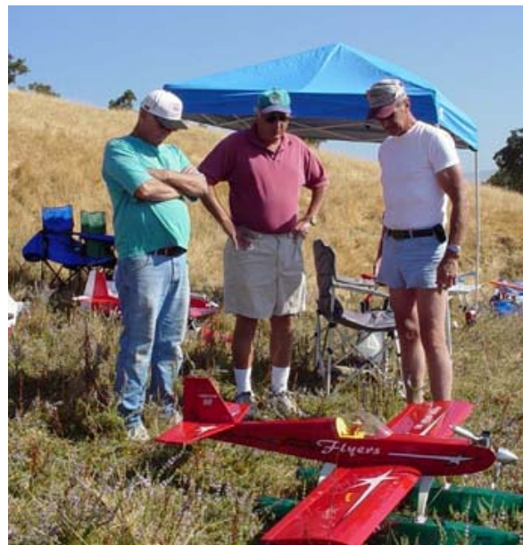
"I don't know, what do you guys think?"