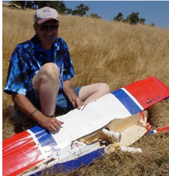
Sid's "Sea Dog" is in airplane heaven