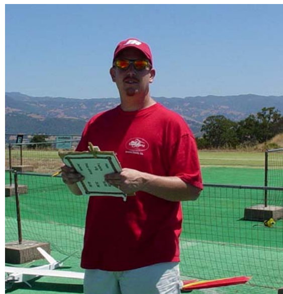
Ace Racer Red