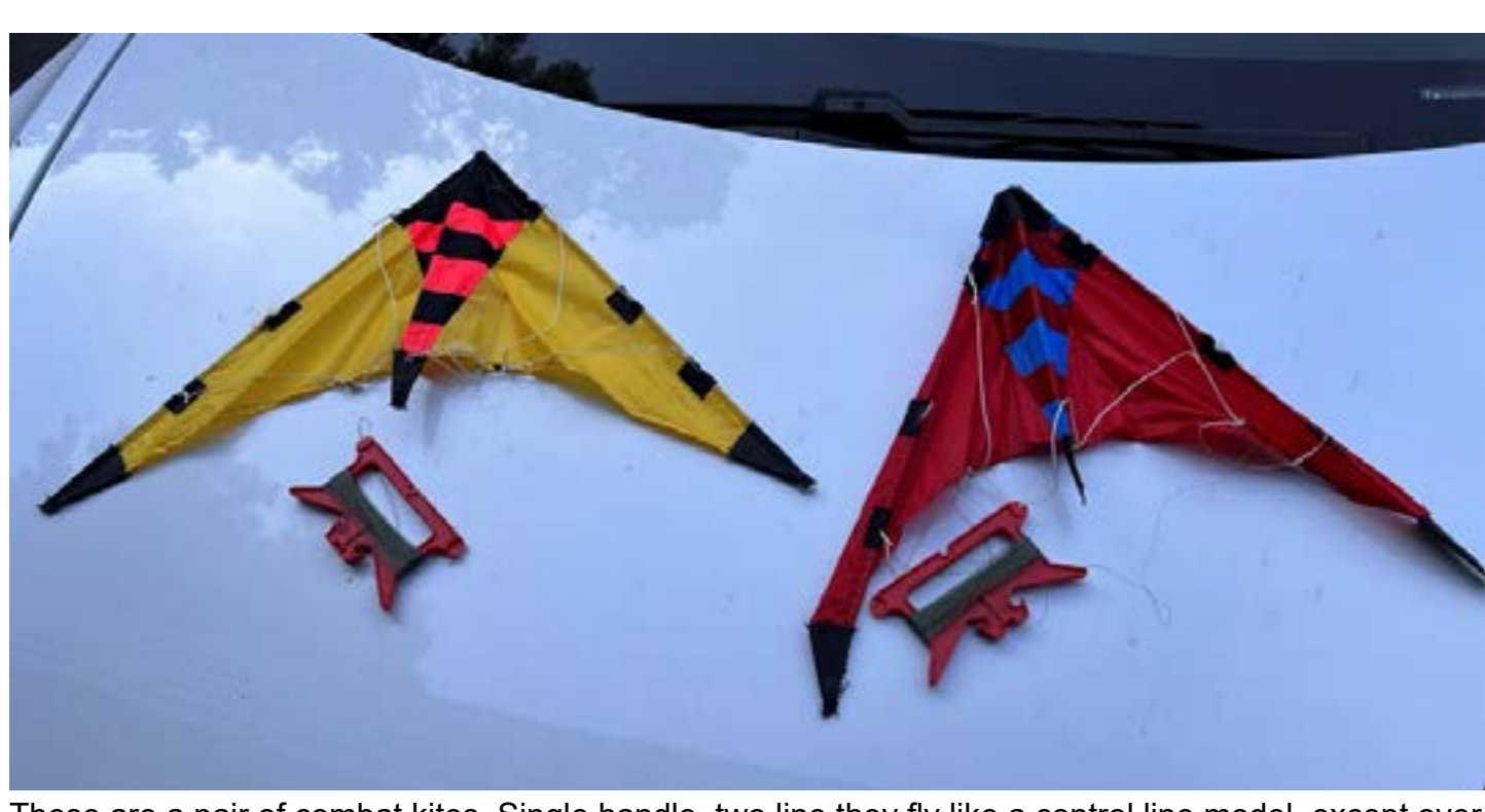
These are a pair of combat kites. Single handle, two line they fly like a control line model, except over about half the circle