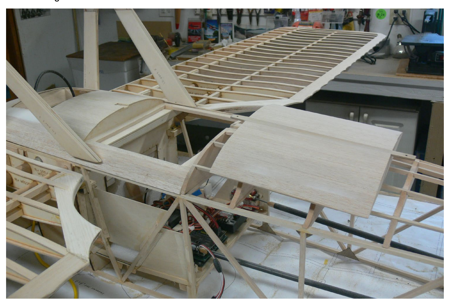
This photo gives you an idea of the size.

Here are the latest photos of my 1/3 scale SPAD XIII. In the first photo you can see the hatch for access to the radio equipment. I also started sheeting the lower fuselage and cowling. The black tubing between the landing gear is the fuel tank overflow and the opening where it is exiting is for airflow over the engine.