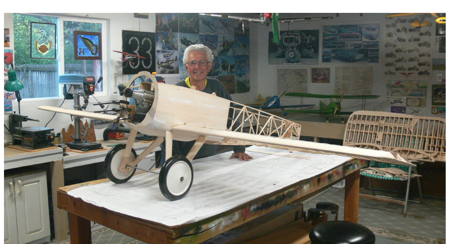
I'm almost finished sheeting the forward fuselage and the top fuselage formers and stringers are done. There are two spruce stringers on each side of the fuselage. The first one has been glued in place. I hope to have the engine mounted in a test stand and start breaking it in shortly.